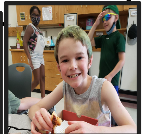
A GRADE FOUR STUDENT ENJOYING A PIZZA LUNCH FROM BP'S! OUR FIRST AND ONLY HOT LUNCH THIS YEAR!