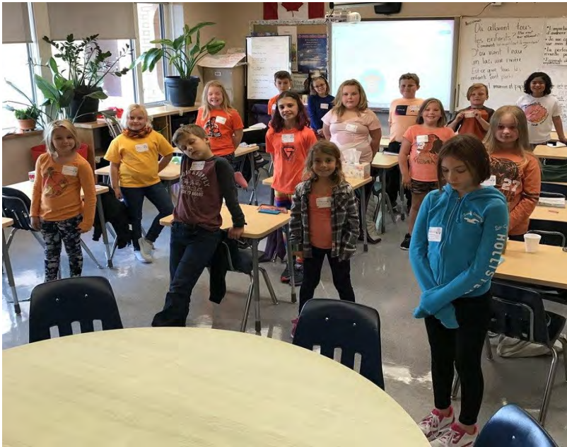
Pictured above: St. Henry's Jr. School Gr. 3/4 class participating in reflection and prayer in recognition of Orange Shirt Day

On September 30th, Christ the Teacher Catholic Schools participated in Orange Shirt Day. On this day, students and staff were encouraged to wear orange to honour former residential school students, their families, and communities. This day is an affirmation of our commitment to ensure that every child matters, and our commitment to reconciliation, anti-racism, Treaty education, and anti-bullying in general.