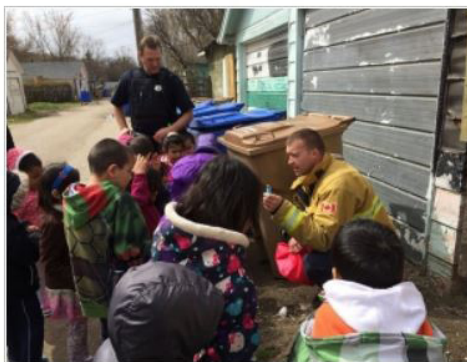
Regina firefighters discuss the dangers and consequences of setting fires with students, parents and teachers during a Safety Walk.

The Regina Fire Department is making headlines with some great work done to prevent children from engaging in arson. Part Two of a feature story in Firefighting in Canada Magazine explains how teamwork brought fire setting activity to record lows in a very short time. The Regina Fire Department, Regina Police Service, and both the Regina Catholic School Division and Regina Public School Division collaborated with great results.