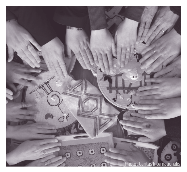
Fourth Station Jesus meets his mother