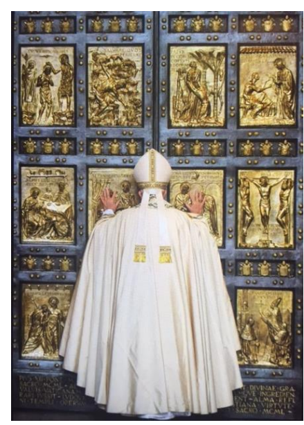
Pope Francis opened the 'Doors to Mercy' on December 8, 2015 at St. Peter's Basicilca in Rome.