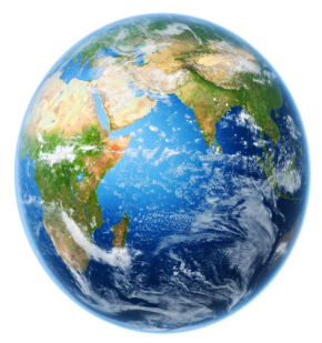
In our schools