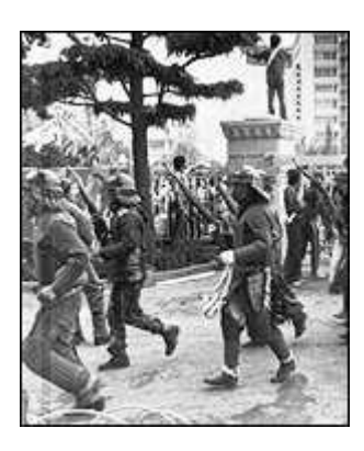
Citizens' army used weapons taken off government troops

Two days later, the city's taxi drivers, headed for the city centre, their horns blaring and headlights flashing.