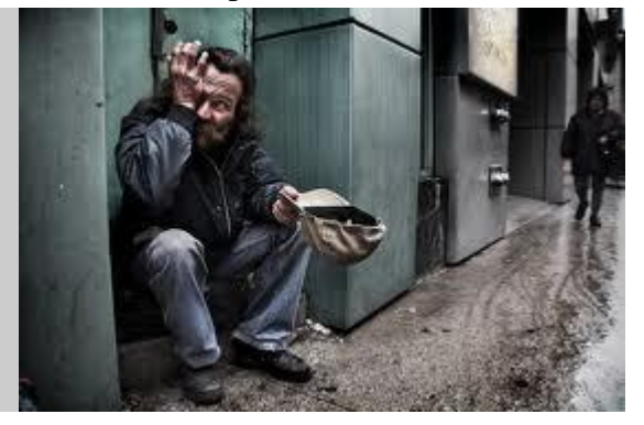
"Blessed are the poor in spirit; for theirs is the kingdom of heaven" Matthew 5:3