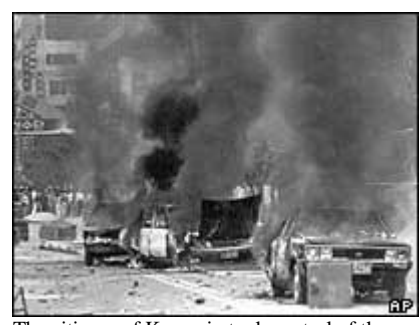
The citizens of Kwangju took control of the city for five days

Many of those who escaped or survived say they still bear physical and psychological scars from the massacre, or feel guilty they lived when friends and family died. Around the country, military reprisals against perceived agitators followed in the immediate aftermath of the massacre.