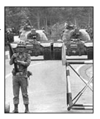
Access to the city was barred during uprising

Angered by the brutality, ordinary citizens began to join the demonstrations.