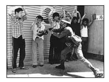
The soldiers' open brutality drew outraged residents into the struggle

In May 1980, hundreds of civilians were massacred by soldiers in the southwestern city of Kwangju after rising up against military rule. Although it was brutally put down, the Kwangju Uprising is now seen by many as a pivotal moment in the South Korean struggle for democracy in the long period of dictatorship following the Korean War.